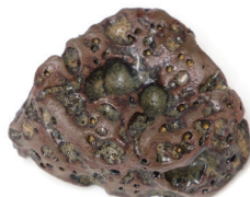
DW | Hazelnut & Temmoku