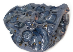
DW | Mazerine & Oasis Blue