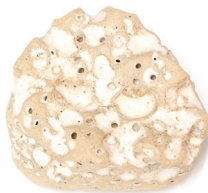
MS | Bone & Ecru