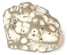
MS | Avocado & Ecru