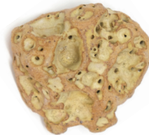
DW | Chartreuse + Ochre